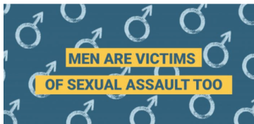
| Men are Victims of Sexual Assault Too

Throughout the year, Label has grown as a publication through its content and contributors. This year, the amount of articles published has doubled over the amount posted in the 2019/2020 academic year (over a 250% increase!). This is an outstanding achievement and it could not have been done without the number of new and existing volunteers as well as the team of Editors and Designers on the Label Committee.