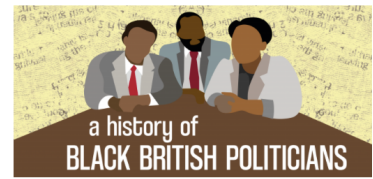
| Black History Month: Black representation in British politics

Even though this year has proved challenging due to the pandemic and not being able to meet up with one another, Label also received contributions from other committees such as CASH and Green Pea; who gave a helping hand in creating eye-opening and original content for students and the public.